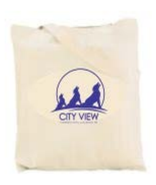
Natural Cotton Tote Bag